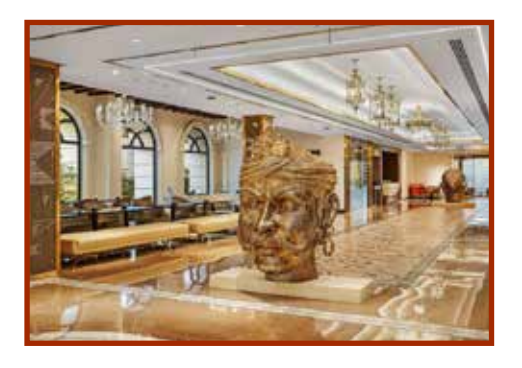
Alkm to Venue