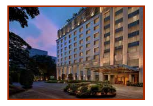
PARK HYATT 4.7km to Venue